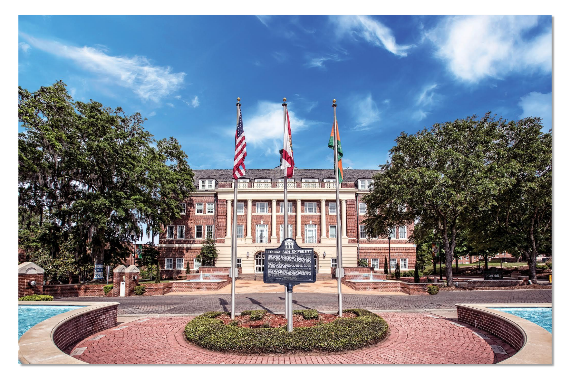
"At FAMU, Great Things are Happening Every Day!"