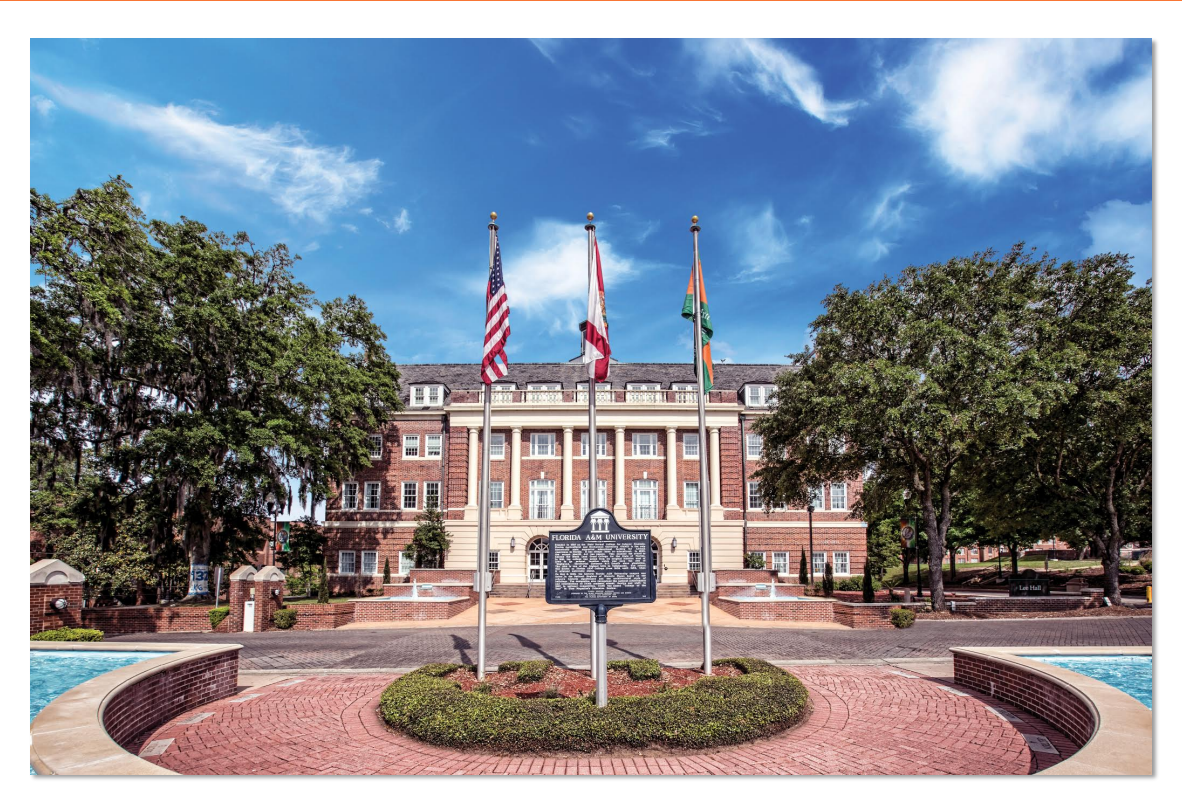
"At FAMU, Great Things are Happening Every Day!"