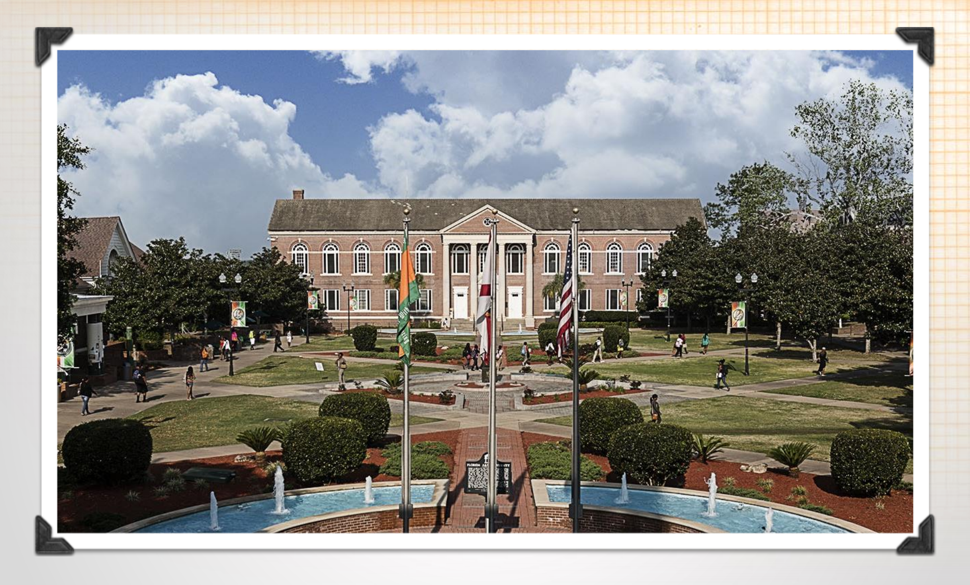
"At FAMU, Great Things Are Happening Every Day."