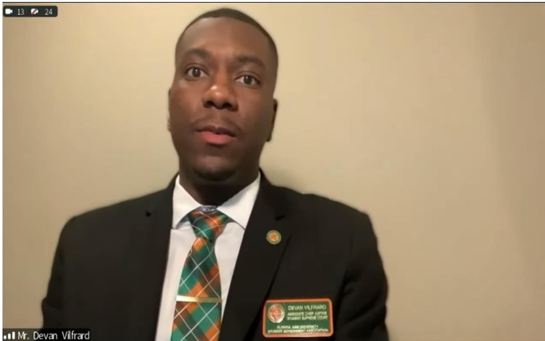
United States House of Representatives Committee on Oversight and Reform