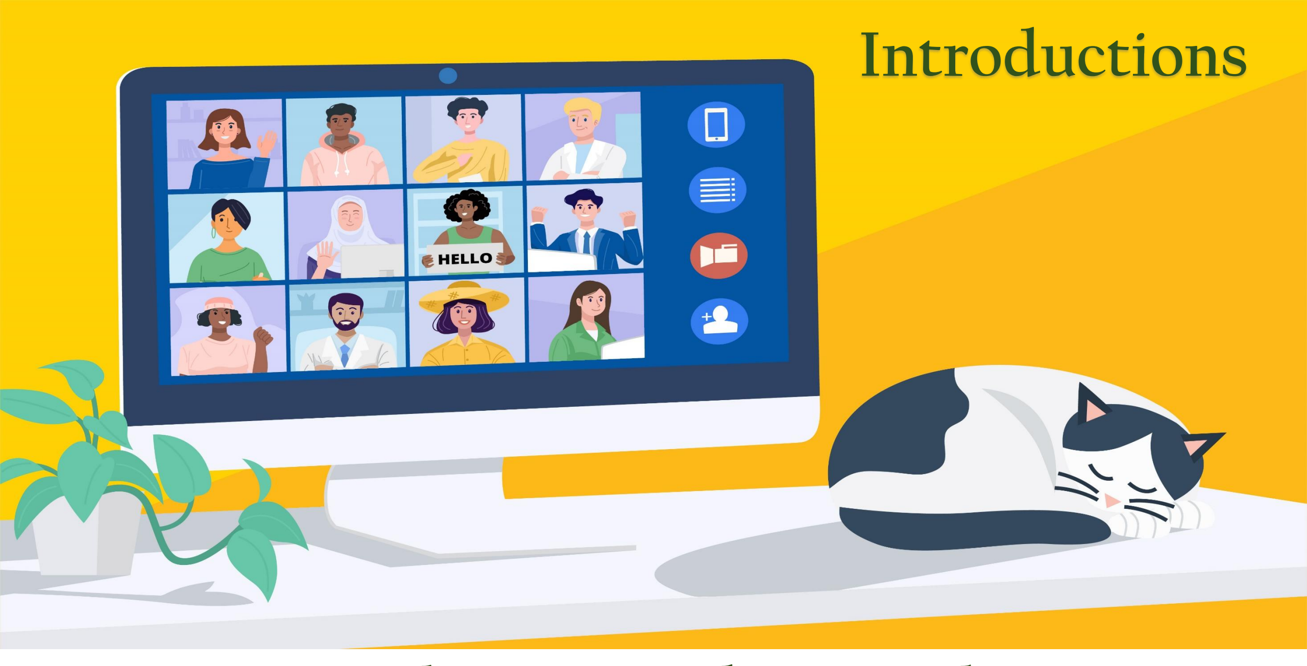
Name, Title, One Word to Describe You